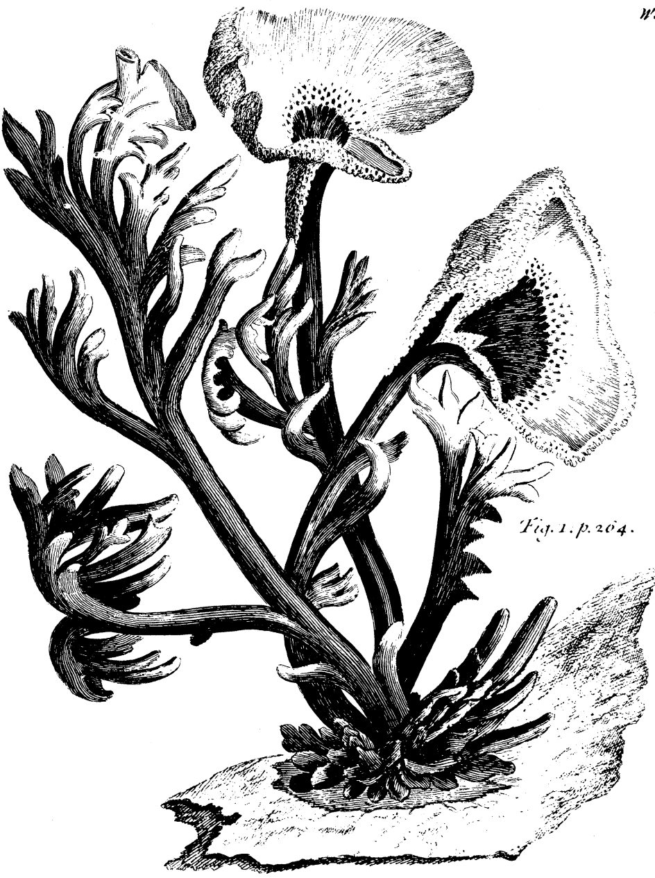
Fig. 1. p. 264.