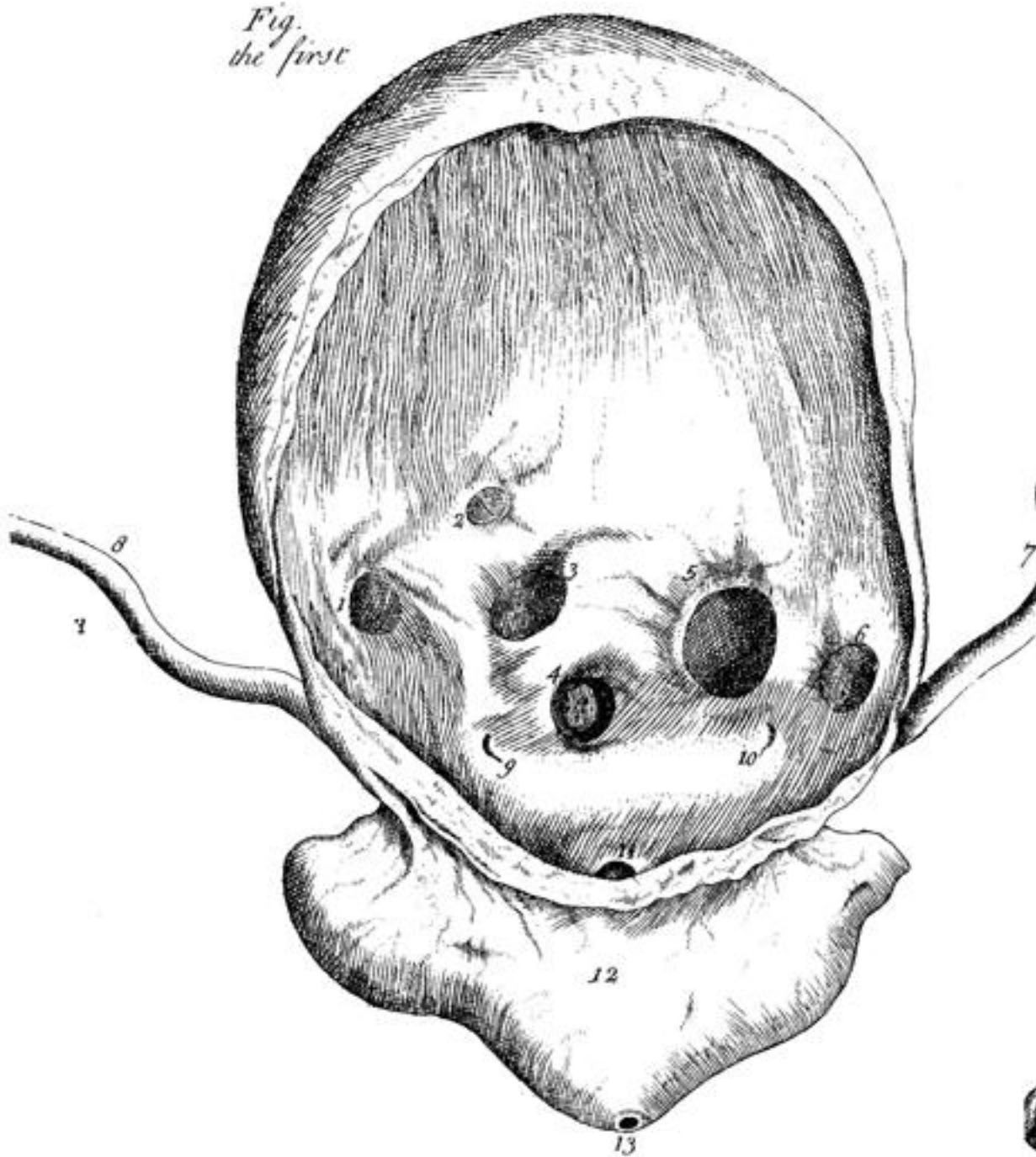
Fig. the first