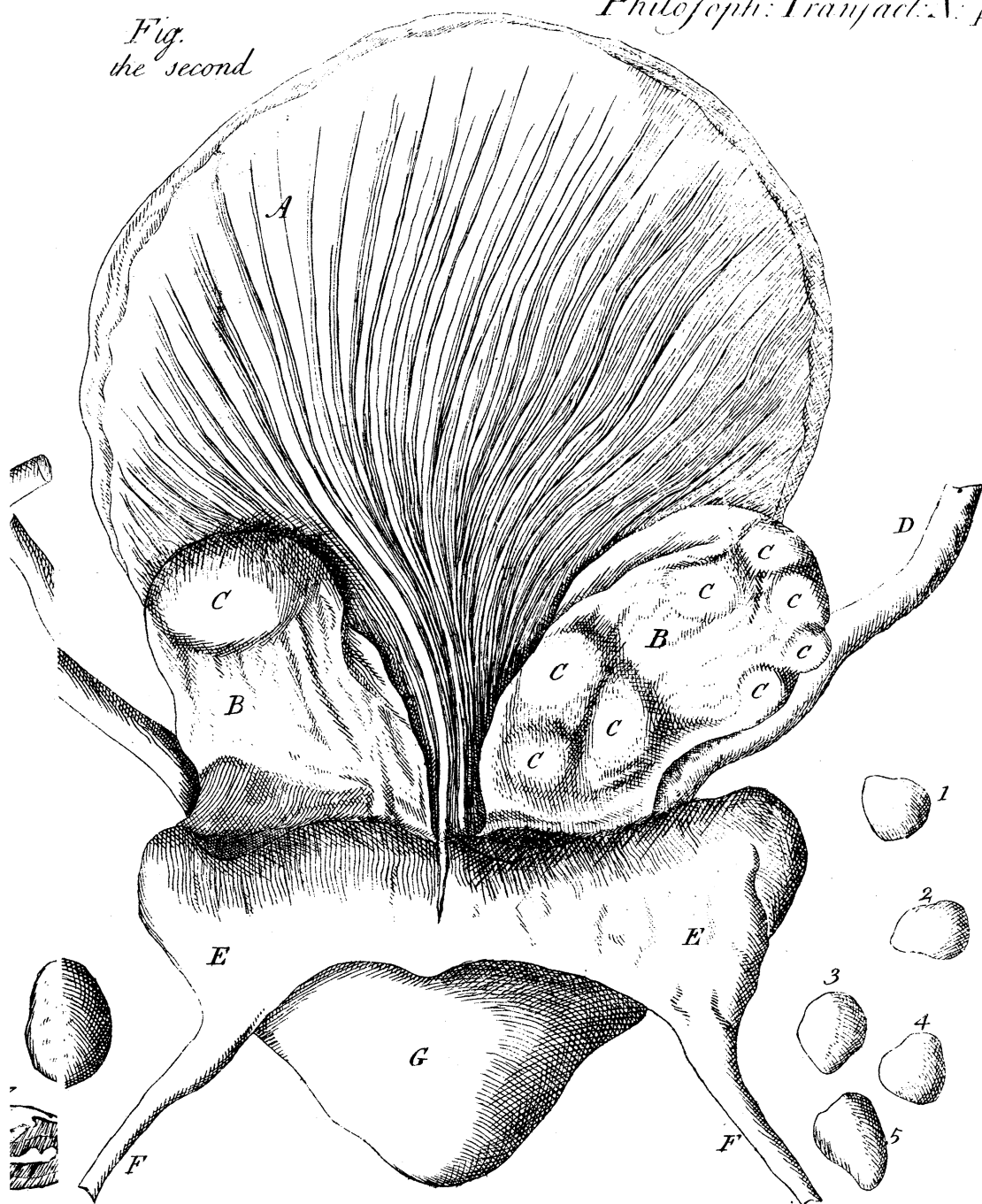
Fig. the second