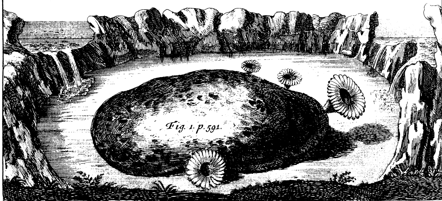
Fig. 1. p. 591.