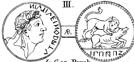
In Gaz. Pemb.

The Samnite-Etruscan Alphabet, deduced from the Coins of C. Papus Mutilus, Veturius, Capua, Acerræ, &c. and used in several parts of Italy so late as the Year of Rome 663.